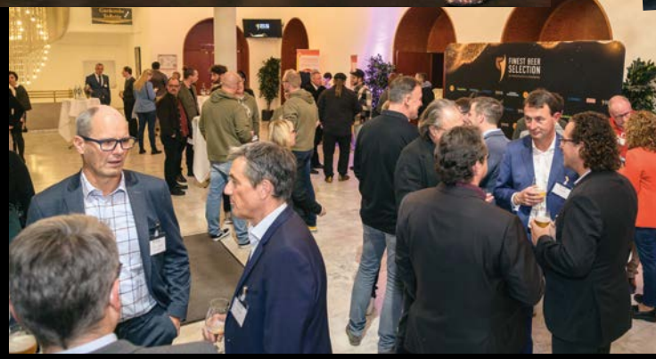
The final event was not just an awards ceremony, but also a social get-together.