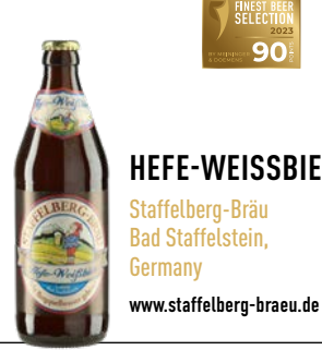
HEFE-WEISSBIER Staffelberg-Bräu Bad Staffelstein, Germany