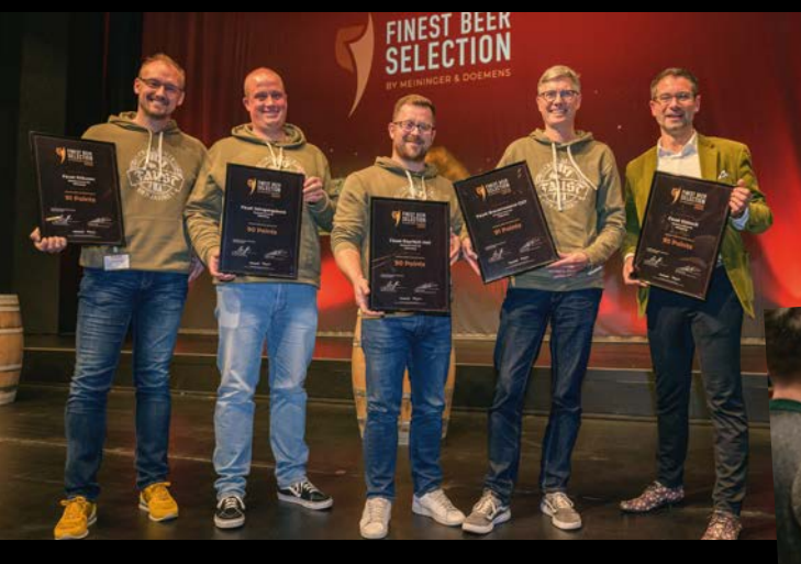
Brewery Faust from Miltenberg, Germany, enters the Finest Beer Selection 2023 with five beers.