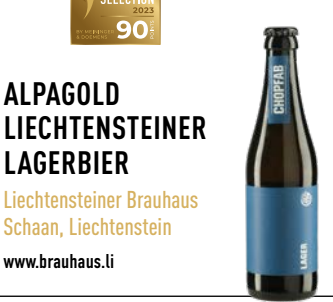
CHOPFAB LAGER IP-SUISSE